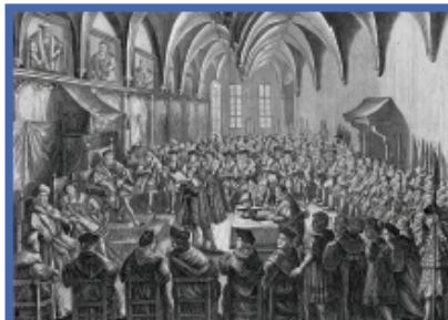
Presentation of Augsburg Confession

In the sixteenth century there was no nation called Germany. Rather, the various duchies and electorates made up a key part of the Holy Roman Empire, a remnant of the European territory once governed by ancient Rome. For much of Reformation times, Charles V governed as Holy