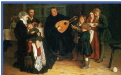
Luther singing with family and friends

Situated within the wider narrative of Christian worship, the story of Lutheran music begins with Martin Luther's own gifts as a lutenist and composer. Unlike Calvin and Zwingli, who appreciated music but distrusted its emotional appeal, Luther did not want to restrict ways in which God's gifts of language and music were used in worship. In a passage that recalls the parade of voices and instruments in Psalm 150, Luther wrote that praise should "sound forth with joy" from "organs, symphonias, virginals, regals, and whatever other beloved instruments there are."